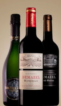
DEMAZEL THE SPIRIT OF EXCELLENCE

We approach our relationships with our suppliers with great care, identifying and selecting partners who share our vision and dedication to quality to create long-term relationships built on mutual trust and expertise. Today Seignouret Frères works with one hundred estates, many of which are still family-run, throughout the appellations of Bordeaux.