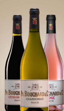
PH. BOUCHARD & CIE AN ICONIC BRAND